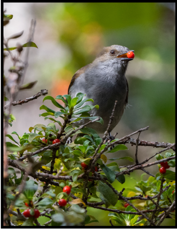
“Oma’o” Barret Oglesby, photograph