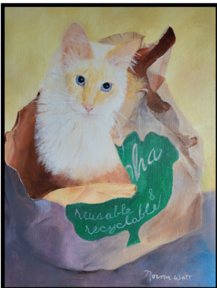
“Cat in the Bag” Norma Watt, oil

Celebration will run from Dec 2nd, 2022, through January 29, 2023. Stop by and see what might inspire you this holiday season!