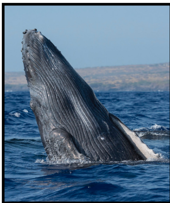
“I Spy” Douglas Perrine, photography