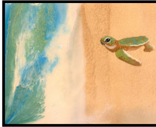
“Turtle Ocean” Debbie Dernberger, acrylic and epoxy resin