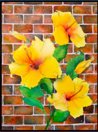
“Yellow Hibiscus on Brick Wall” Julie McHue, watercolor