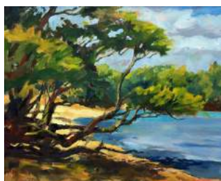
"Cove at Waialea Bay" oil by Ilmar Reinvald