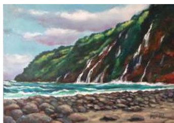
"The Beach at Waipi'o East Pali" Oil by Janice Gail