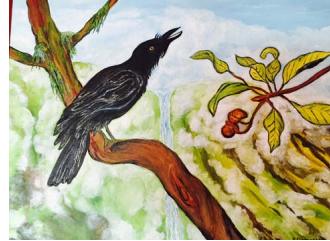
"Alala Crow" Oil by Pat Dinsman

The Waimea Arts Council is dedicating the month of May to honoring these unique species as an effort to raise awareness and help preserve our precious natural treasures.