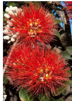
"Red Ohia"