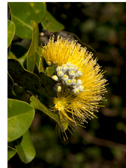
"Yellow Ohia"