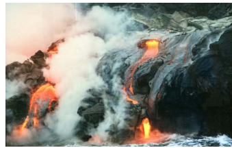
"Lava reaches the Ocean"

The Firehouse Gallery is the most visible project of the Waimea Arts Council and is located at 67-1201 Mamalahoa Highway, in the heart of downtown Kamuela. It is housed in South Kohala's historic old fire station, at the crossroads of Mamalahoa Highway and Lindsey Rd. (Hwy. 19 and 190), across from the Waimea Chevron. Gallery is open Wednesday-Friday and Sunday, 11 am to 3 pm, and Saturdays 9 am to 3 pm. There is plenty of free parking behind the building.