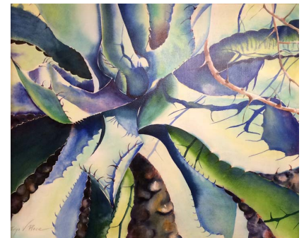
"Agave" Watercolor by Irina Place