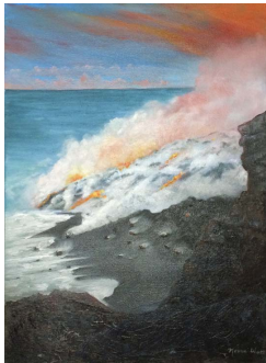
"Lava from Pu'u O'o" Oil by Norma Watt

During the month of April, the Firehouse Gallery in Waimea will exhibit a colorful artistic showcase inspired by the Legends of Madame Pele-Earth, Wind & Fire.