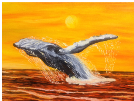
"Sunset Whale" Oil by Pat Dinsman

All Waimea Arts Council members are local artists inspired by Hawaii Island's natural beauty.