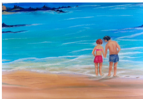
"Beach Walking" Oil by Collie Will