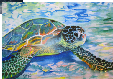
"Underwater Walker" Watercolor by Collie Will