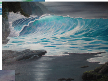
"Wave" Oil by Terry Bensch