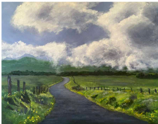
Firehouse Gallery September 2-25, 2022