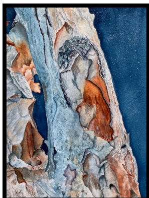
"Eucalyptus Bark III" Julie McCue