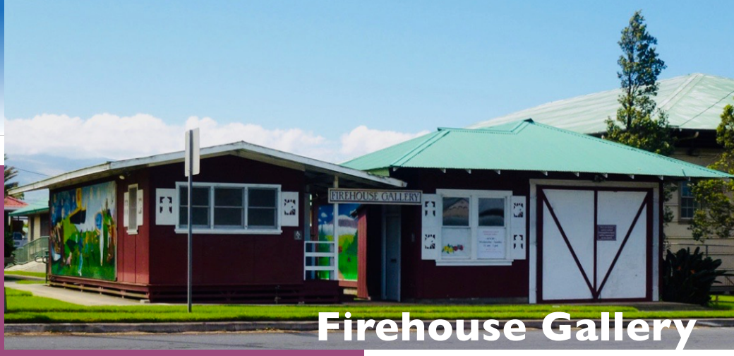
Call for Entries!