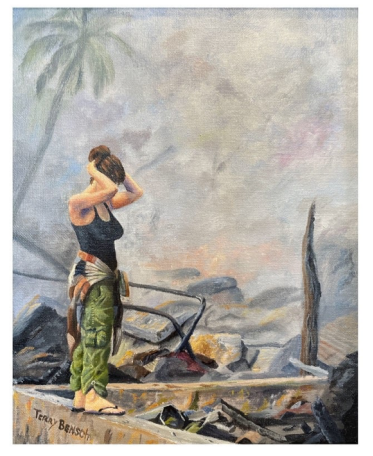
Terry Bensch "Irruptions and Interruptions" Oil

http://www.waimeaartscouncil.org/ Facebook: Waimea Arts Council/ Firehouse gallery