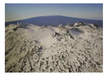
"Mauna Kea"