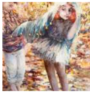
"Fairytale" by Audrey Sofin