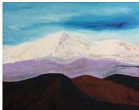
"Winter on the Big Island" Mixed Media by Pat Dinsman

All of the art work is created by local artists who are also members of the Waimea Arts Council and will include photography, drawings, original oil paintings, watercolor paintings or mixed media. Additionally, the collection will include handcrafted Koa wood art pieces.