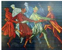
"Horrah Dance" by Chaim Goldberg

The Firehouse Gallery is the most visible project of the Waimea Arts Council, an all-volunteer non-profit organization that sponsors programs, exhibits and education related to the arts.