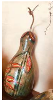
Gourd by Reggie Ruiz

More photos from the exhibition on next page