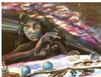
"Poliahu" acrylic by Susun Gallery