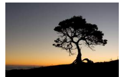
"Lone Koa"