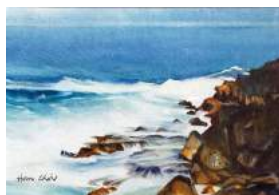
"Seashore" watercolor by Han Choi