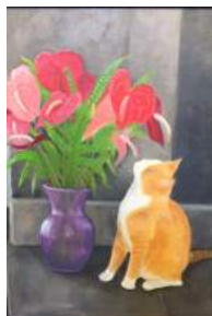
"Nose to Nose" oil by Norma Watt