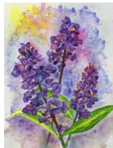
"Blue Ginger" watercolor by Julie McCue