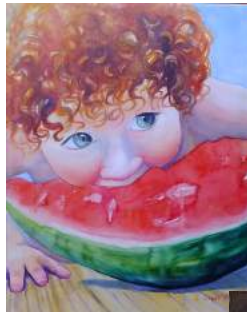
"Boy Eating Watermelon" Watercolor by Irina Place

Come and enjoy some "Fire and Ice" and "Summer Fun"!