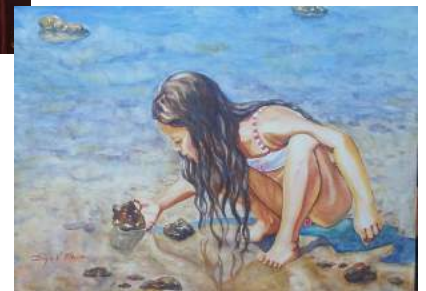
"Girl on the Beach" watercolor by Irina Place

The Firehouse Gallery is the most visible project of the Waimea Arts Council, an all-volunteer non-profit organization that sponsors programs, exhibits and education related to the arts. It is strategically located in the heart of downtown Kamuela in South Kohala's historic old fire station, at the crossroads of Mamalahoa Highway and Lindsey Rd. (Hwy. 19 and 190), across from the Waimea Shell Station. Exhibits change monthly. The gallery is open Wed.-Fri. and Sun., 11 am to 3 pm, and Sat., 10 am to 3 pm. There is plenty of free parking behind the gallery.