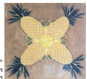
"Pineapple Squared" mixed media/fabric on wood by Anna Sullivan