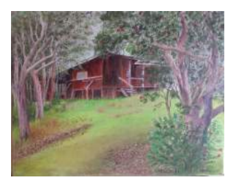
"Saddle House" oil by Norma Watt