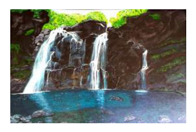
"Three Falls Pool" acrylic by Marc Scichitano