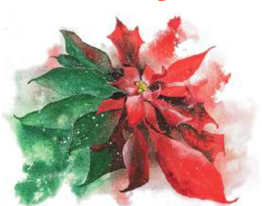
" Wild Poinsettia" watercolor by Julie McCue