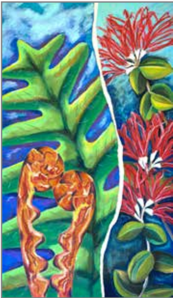
Hapu`u with Ohia Lehua Soft Pastel 20"w x 30"h

Color shift textures are created from liquid dyes on silk painted in freestyle form, and plant shapes using the wax tjanting tool method. Soft pastel is my choice for capturing sea and landscapes during outdoor painting sessions. Watercolor abstraction and studio still life compositions give me more venues. I also express my love of abstract through fashionable silk wearables of scarves, tunics, and silk jewelry. Clay is a recent addition, and now metal forming is thoroughly exciting! Further combinations of silk with clay and metal are just waiting to be made.