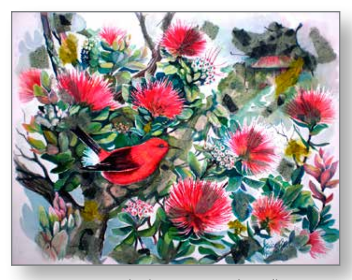
Apapane and Lehua 2 - Watercolor Collage