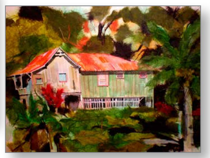
Niuli`i Old Home - Collage 1