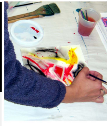
Pastel Still Life Painting