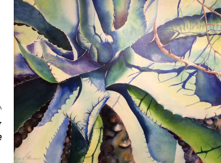
"Agave Watercolor by Irina Place