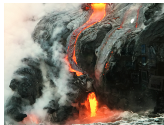
"Lava Flow Reaching Ocean"