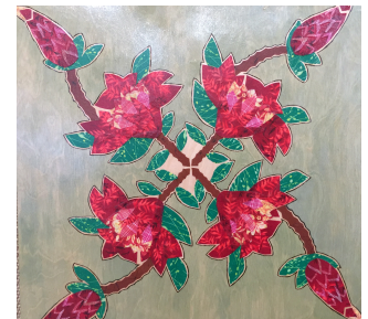
"Stormy Weather"