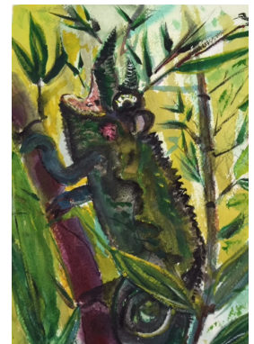
"The Hunter" watercolor by Marty Allen

The Firehouse Gallery is the most visible project of the Waimea Arts Council and is located at 67-1201 Mamalahoa Highway, in the heart of downtown Kamuela. It is housed in South Kohala's historic old fire station, at the crossroads of Mamalahoa Highway and Lindsey Rd. (Hwy. 19 and 190), across from the Waimea Chevron. Gallery is open Wednesday-Friday and Sunday, 11 am to 3 pm, and Saturdays 9 am to 3 pm. There is plenty of free parking behind the building.