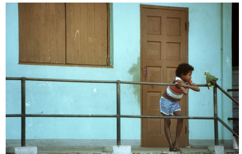
B is for Belize "Freinds"

photography is getting the exposure, focus, and composition as planned in an image. The art of photography is capturing moments, experiences and feelings. I am always striving to improve both my art and my craft."