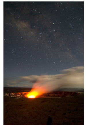
N is for night "Starlight, Moonlight, Earthlight"