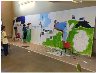
See article on Page 1

The Firehouse Gallery is the most visible project of the Waimea Arts Council and is located in the heart of downtown Kamuela in South Kohala's historic old fire station, at the crossroads of Mamalahoa Highway and Lindsey Rd. (Hwy. 19 and 190), across from the Waimea Chevron. Gallery is open Wednesday-Friday and Sunday, 11 am to 3 pm, and Saturdays 9 am to 3 pm. There is plenty of free parking behind the building.