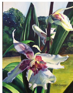
"Glacier Green Orchid" Watercolor by Carolyn Lancaster