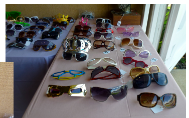
Just a few of the many sunglasses that people could choose from.