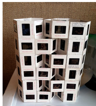
"Slide Tower" Tatsuya Suzuki, HPA Built with 35mm slides.