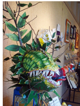
"Little Shop of Horrors - Seymour"

This is the 6th year that WAC has sponsored this program by offering exhibition space and accepting entries from North Hawaii students. Recycle Hawaii is a non-profit 501(c)3 organization. For more information about Recycle Hawaii call 969-2012 or go to www.recyclehawaii.org .