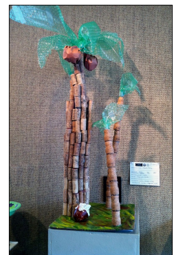
"Tropical Cork" Trent Perry, HPA Corks, paper and bubble wrap.