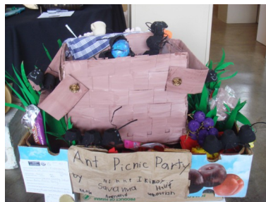
"Ants Picnic Party"

Cardboard boxes, socks, plastic cup, packing materials, fabrics.