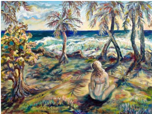
"Yoga on the Beach" Oil painting by Ginger Sandell

Artists have interpreted "Life's a Beach" figuratively and literally, by creating art in realistic, impressionistic, and abstract modes.